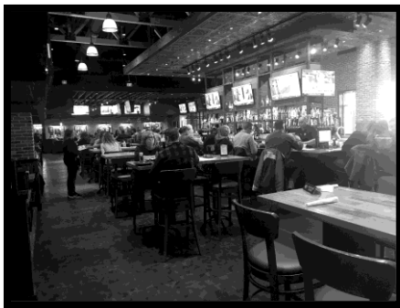
Casino Sports bar

As soon as you are dropped off at the bus stop at the casino enter the casino and step to the left and you will be at the food court, which had a very varied assortment of quick food restaurants. Should you want to eat at the Sports Bar, take a right.