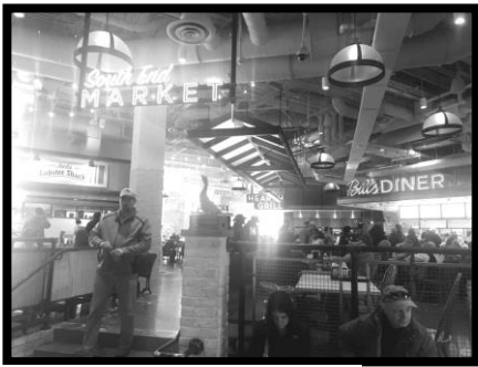
The food Court

11:30AM: arrive at the MGM Casino in Springfield. Chris and I spent a day in Springfield to check out the tour sites. At our board meeting we decided to use the casino as not only a tour site, but also as a place where people could acquire cheap lunches on their own at the casino food court.