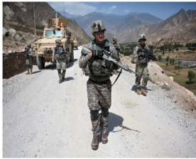
Soldiers on patrol in Area of Operation (AO) Gator

“Out of every 100 Afghans, 95 of them are good people with a very rich culture and beliefs system”