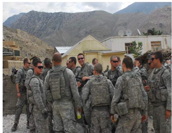
Right: 2nd Platoon Soldiers prepare for pre-mission patrol brief on FOB BLESSING