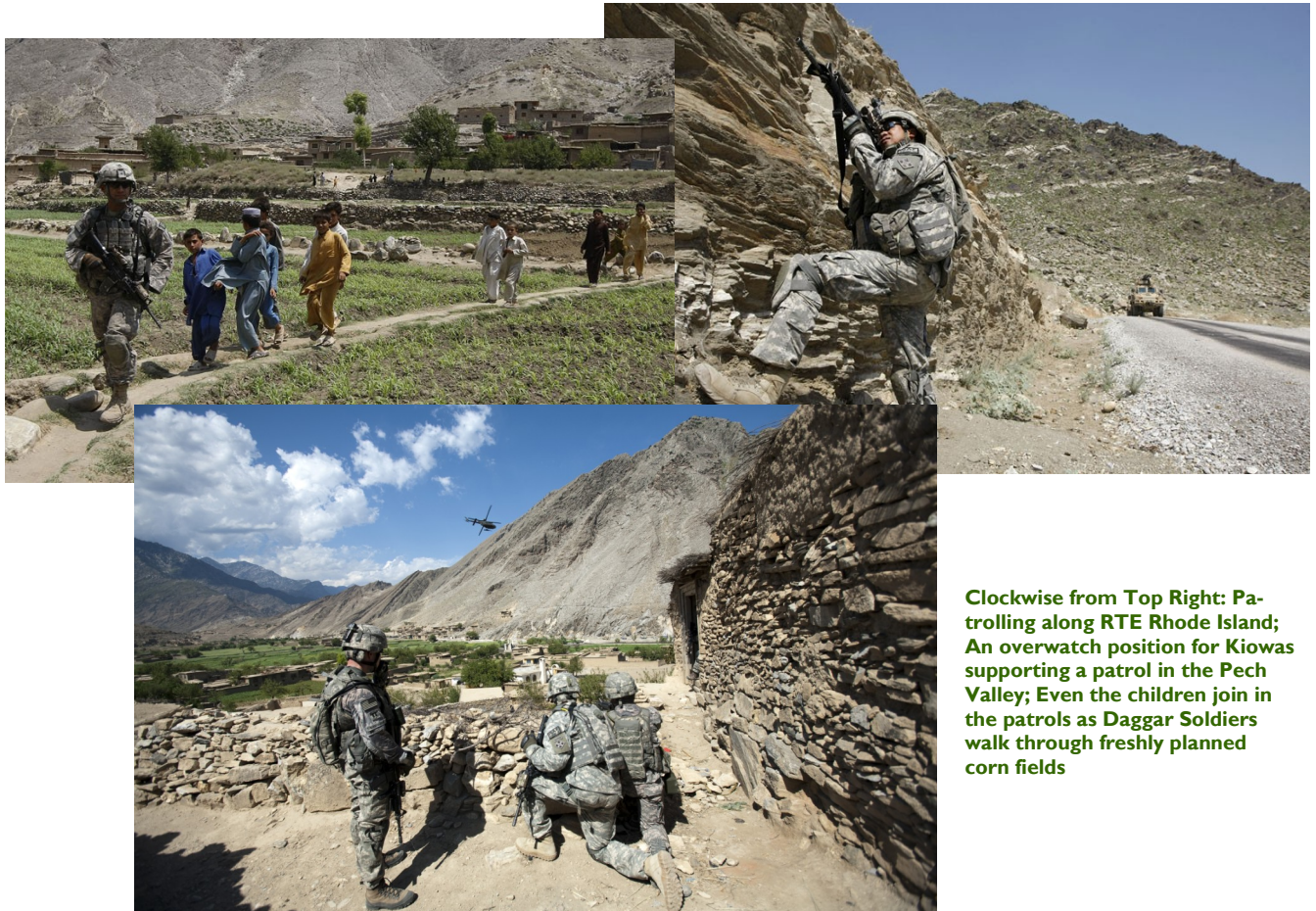
Clockwise from Top Right: Patrolling along RTE Rhode Island; An overwatch position for Kiowas supporting a patrol in the Pech Valley; Even the children join in the patrols as Dagger Soldiers walk through freshly planned corn fields