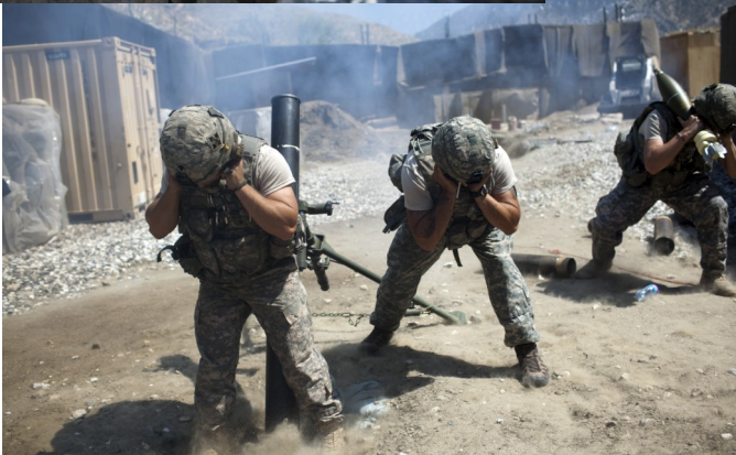
Top: HHC Soldiers returning from inspections of local observation posts around FOB BLESSING