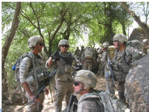
Upper Left: Pausing while on patrol in the Watapur District, Afghanistan