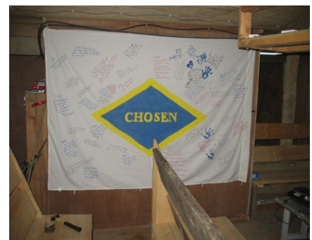
Right: The Chosen flag at the company headquarters on COP HONAKER-MIRACLE