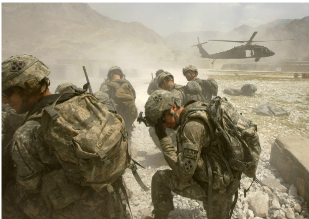
Above: Soldiers from Gator Company prepare for an air assault to support troops in contact