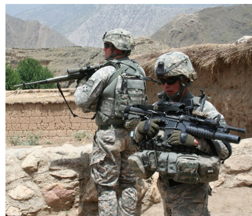
Above: Gator on patrol in the Manogai District of Afghanistan